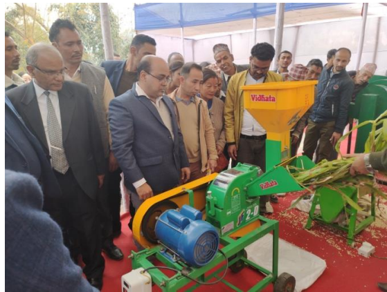
Technology and Machinery Demonstration Mela 2020 and farmers interaction at CAEPHT