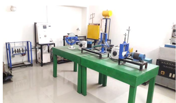
Theory of machine laboratory