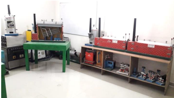
Thermodynamics and heat engine laboratory