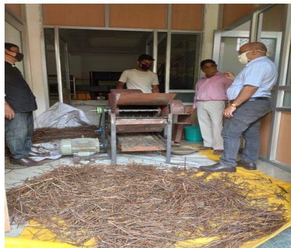
Glimpses from the PG research carried out by students