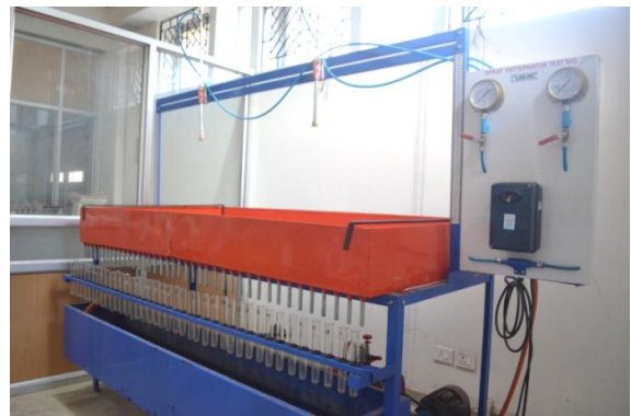
Farm Machinery Testing Laboratory