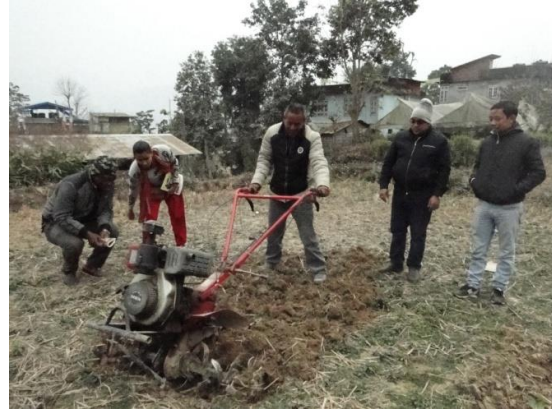
Exposure visit of PG students to progressive farmer's field and interaction