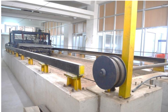
Soil Dynamics Laboratory